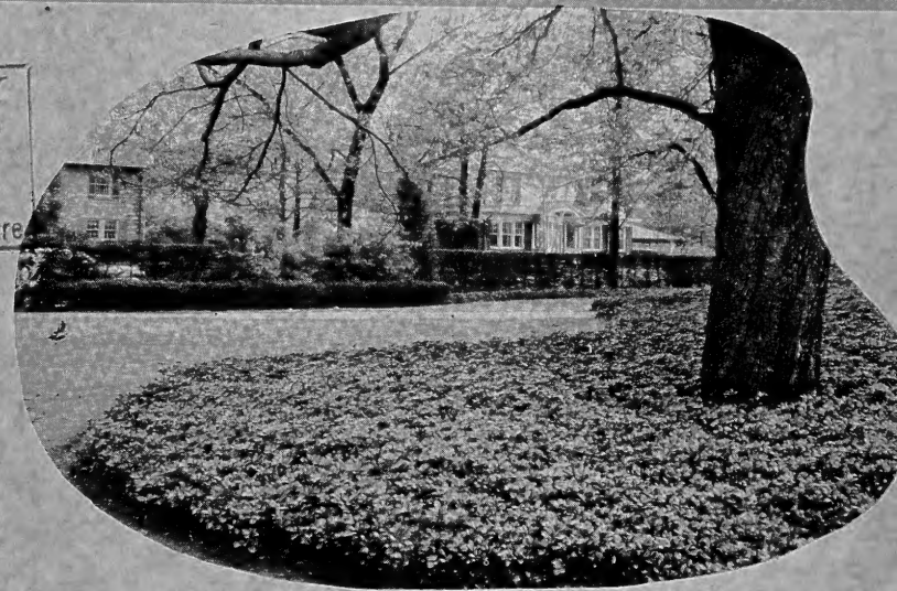
A PACHYSANDRA Planting beneath a large old American Ash tree. This area becomes extremely dry during the summer months but the dense growth of the Pachysandra indicates its determination to survive under such adverse conditions.

LIBRARY RECEIVED ★ FEB 6 1958 U. S. Department of Agriculture